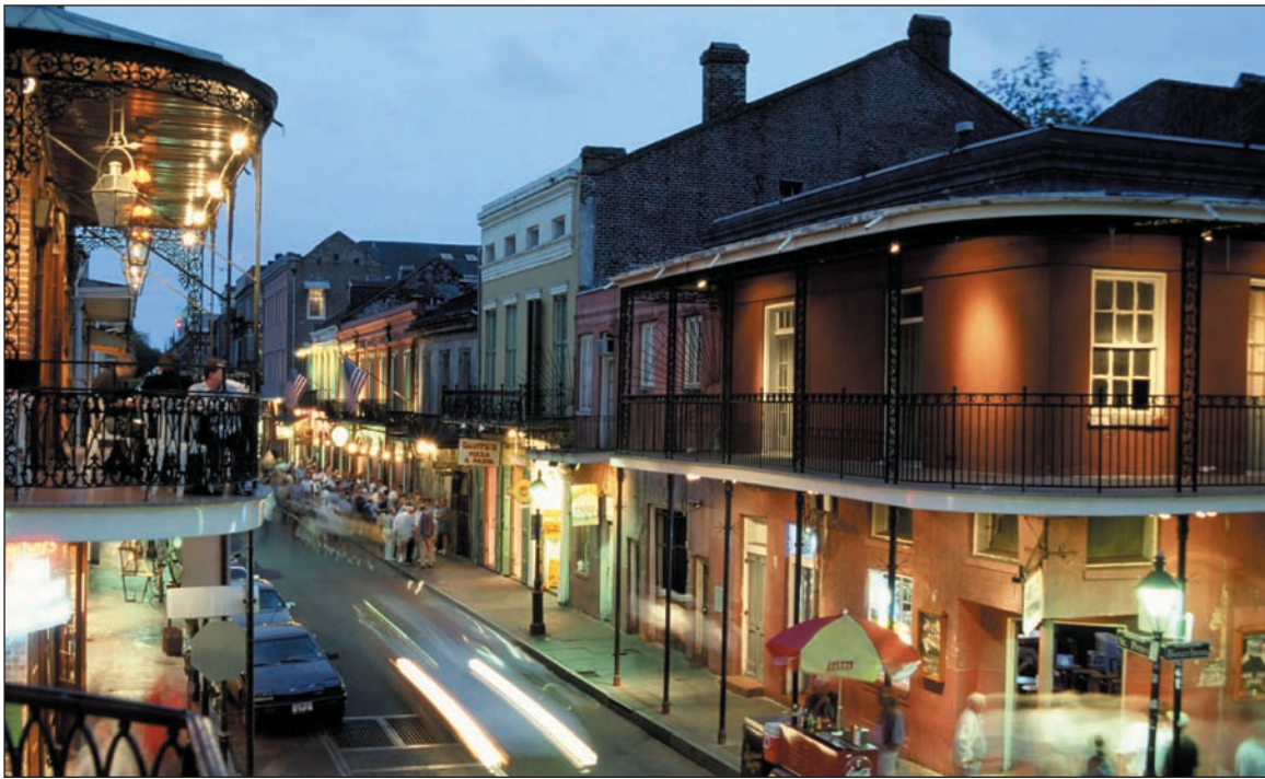
Bourbon St., New Orleans

T HE ROADS TO AMERICA'S SOUTH ARE PAVED WITH HISTORY. IN GRAND CITIES SUCH AS CHARLESTON, SOUTH CAROLINA, WHERE HORSE-DRAWN CARRIAGES PASS CENTURIES-OLD MANSIONS, YOU CAN AT TIMES FEEL AS THOUGH YOU'VE BEEN TRANSPORTED IN TIME. IN SAVANNAH, GEORGIA, OVER HALF OF THE 2,500 BUILDINGS HAVE ARCHITECTURAL OR HISTORIC SIGNIFICANCE. STROLL THE STREETS OF NEW ORLEANS' FRENCH QUARTER AND YOU'LL DISCOVER A UNIQUE NEIGHBORHOOD OF A BYGONE ERA. THE TIMELESS BEAUTY OF THESE CITIES IS LEGENDARY.