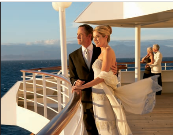
The romance of Crystal Cruises

Maybe you've always dreamed about traveling to the tropical shores of French Polynesia. Paul Gauguin Cruises offers a number of itineraries ranging from