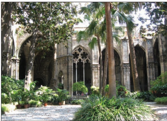
The Picasso Museum

The Picasso Museum is the "must-see" museum to visit in Barcelona, for the work of the Barcelona-born artist and for the building itself. It is five