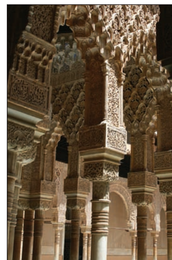
Detail from the Nasrid Palace

Like Spain, Portugal is really a nation of different parts. In the north is the town of Porto, classified by UNESCO as a World Heritage site, and it is where the country's world famous port wine originated. A visit to the port lodges in Vila Nova de Gaia will get you a free tasting of the famous product.