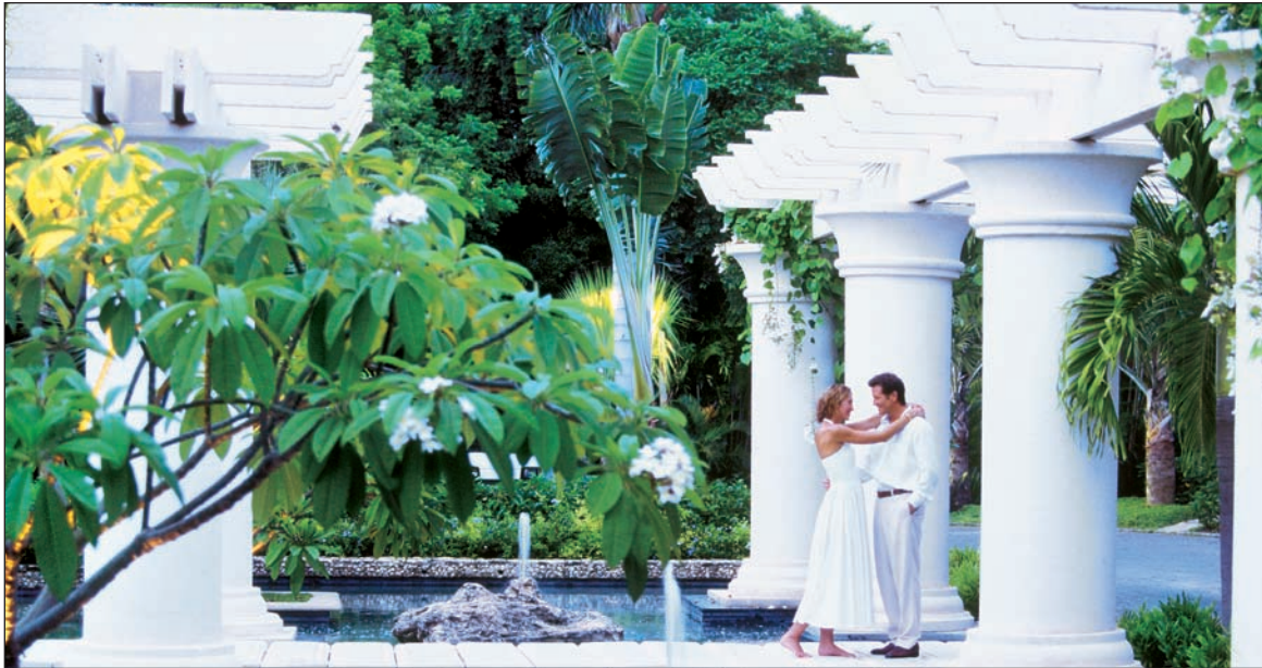
Honeymooners in Punta Cana

A HONEYMOON SHOULD BE THE MOST EXTRAORDINARY VACATION OF YOUR LIFE, FILLED WITH MEMORIES YOU WILL CHERISH FOREVER. SO DON'T RUN TO THE ALTAR BEFORE STOPPING TO TRULY CONSIDER THAT PERFECT HONEYMOON ESCAPE ONCE THE VOWS HAVE BEEN RECITED.