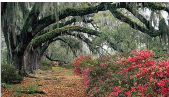
Magnolia Plantation in Charleston, South Carolina

One of the best ways to acquaint yourself with Charleston is to walk the streets of the downtown area. Many of the historic district's pastel-painted homes, B&Bs, restaurants and shops are located here. The historic district encompasses more than 2,000